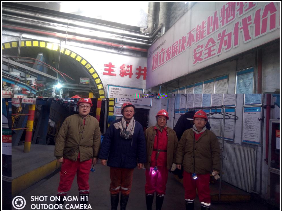
SHOT ON AGM H1 OUTDOOR CAMERA